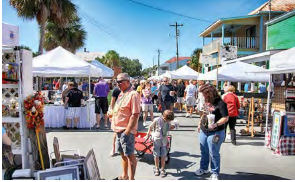
Cedar Key Seafood Festival