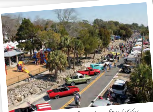
Fiddler Crab Festival in Steinhatchee